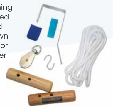
ITEM #DIY Ranger

Everything you need to build your own overdoor shoulder pulley.